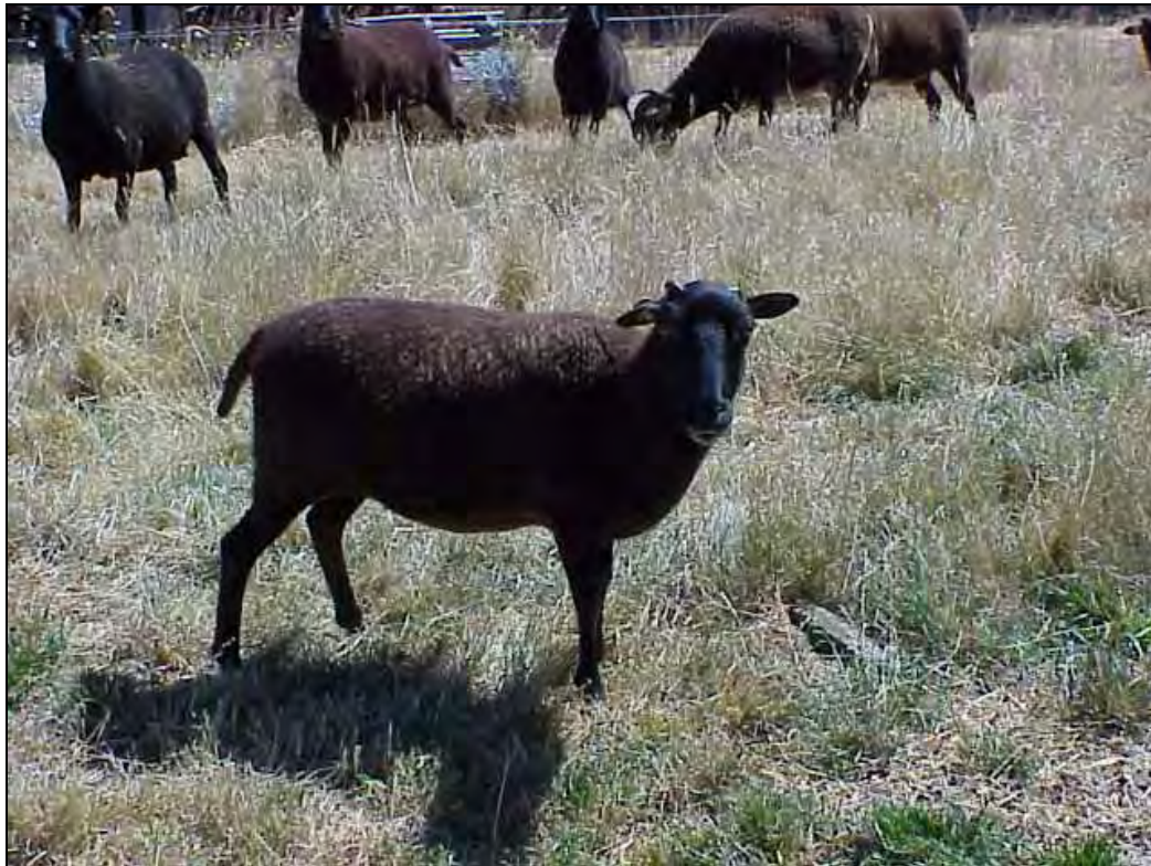
Figure 11. Blue Mountain Astoria. In some cases of a light phase wild pattern, the pigmentation is so light, and/or the fleece is so long, and/or so sun-faded, that it can be difficult to spot the pattern. But here the eye-rings, inner ears, and leg patterns show clearly that this sheep is wild pattern. (No light phase solid color Soay has yet been identified in North America).