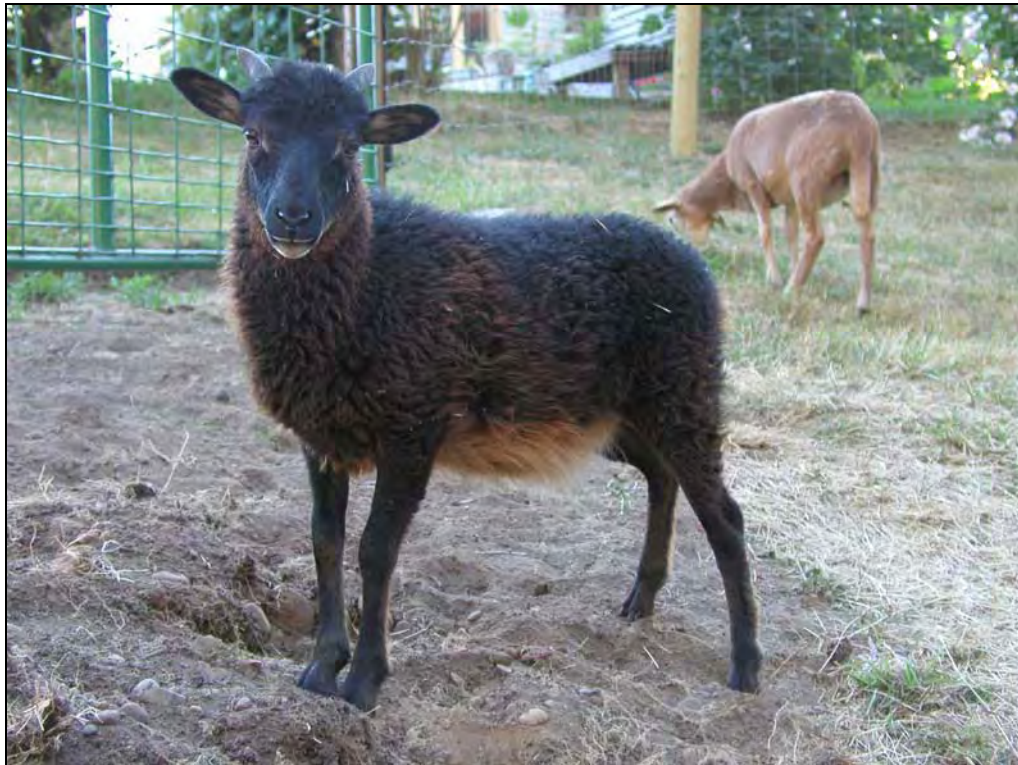
Figure 5. Pages's Bella is a dark wild pattern, as is obvious here by her distinct belly color. Note however the clear markings under chin, the 'sugar lips', the pre-orbital eye spots, and the inner ear. One has to look hard to see the pattern in the legs, but it is there. (Not every photo shows every marking clearly.).

The various points above are best demonstrated with some examples. Note that these have all been chosen precisely because there might be some question in some people's mind, or at first glance, they might be somewhat difficult to precisely identify the coat pattern.