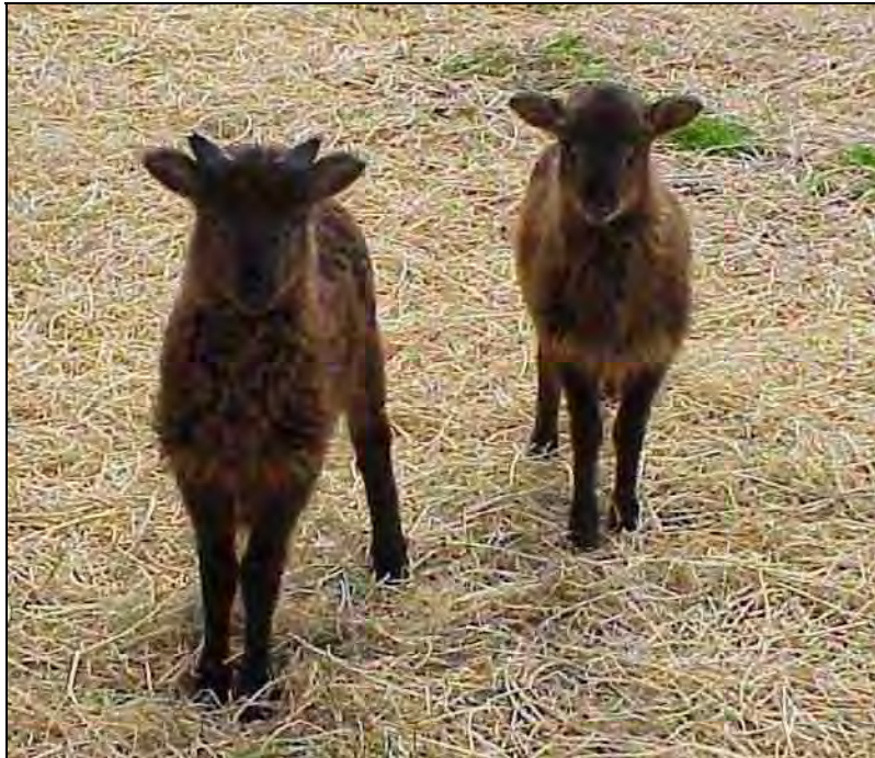
Figure 9. Greener Pastures <Half Mile Mica> 3 Caravaggio and (very rare!) Soay triplets. The reader should be able to readily discern that the dam is a solid black, as are two of the triplets, but one triplet is wild pattern.