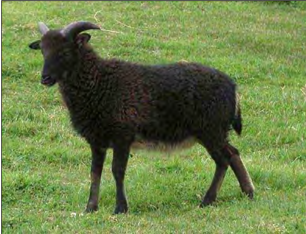
Figure 7. Pages's Bonita , a self-colored black. I find that the inner ears, and absolutely uniform color on legs and face to be the best consistently reliable indicators of self-coloring (solid pattern).

Figure 6. Blue Mountain Basalt is another dark wild pattern. While his belly and rump are clearly shown, his 'sugar lips', eye spots, and inner ears all would show him as clearly wild pattern. His legs also show the pattern. Basalt is from a group of related NA Soay that seem to have a very heavy load of dark phase eumelanin, but almost no pheomelanin, causing the belly to be nearly white, and virtually no hint of reddish in the upper body. His dam, Blue Mountain <Westwood> Boanna is very similar coloring. If any 'line' in the NA Soay were to be suspects for 'black-and-tan' genotype, this would be my candidate.