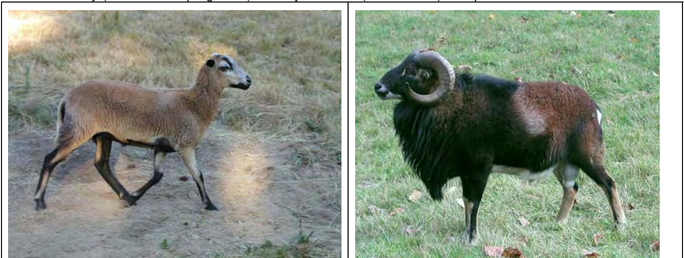
Figure 4. Lucy, an American Blackbelly, is technically a ‘badgerface’ agouti pattern Ab. Massena’s Max, the NA Soay ram, is a wild agouti pattern, A+. This ‘wild’ pattern is often also called ‘mouflon’, an obvious reference to the similarity (and believed progenitor) of Soay, the feral (or semi-wild) European Mouflon.

The areas I have found to be reliable locations for a clue are, in the usual best order for spotting this pattern in photographs, are: