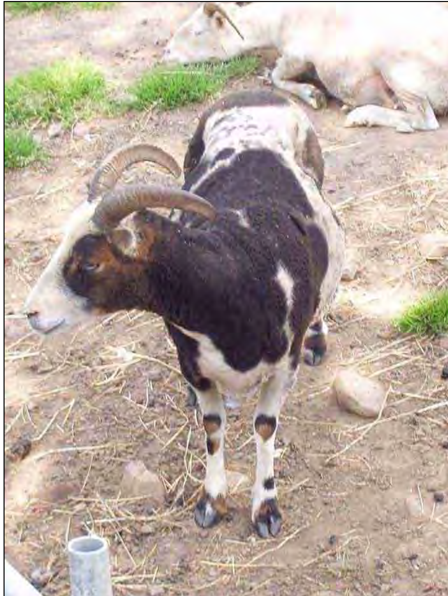
Figure 12. Hareknoll Annabel. Even with the extensive white, the non-white areas still are fortuitously left in just the right locations to show patterns in the legs that clearly identify her pattern as wild. This is also affirmed by her pre-orbital spot and partial eye-ring. In other photos the wild pattern in both the insides of her ears and rump spot are distinct as well.

In her flock, so many sheep have so much white that many individual photographs simply do not have the key markings to examine. Additionally, her flock carries all combinations of dark and light phase, wild and self pattern, and white spotting and not, so it can be a challenge to deduce the genotype with certainty. One particularly interesting case for our discussion here is Annabel , shown below.